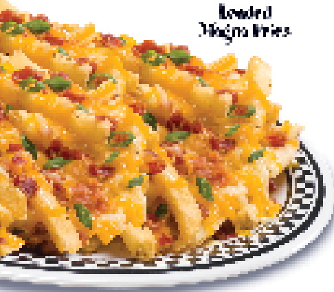
Loaded Magna Fries

LOADED MAGNA FRIES A mound of our crispy thick-cut seasoned fries, overloaded with Cheddar-Jack cheese and chunky bacon. Served with cool Ranch dip 8.99