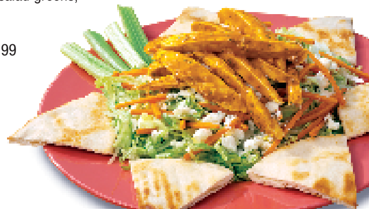
Boneless Wing Salad